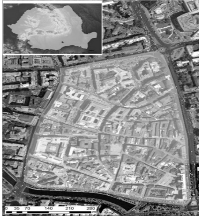
Fig. 2. Study area.

The main goal of this research is to find a suitable shelter in the historical centre to be used in the post-disaster phase if an earthquake occurred in Bucharest City (Figure 2).