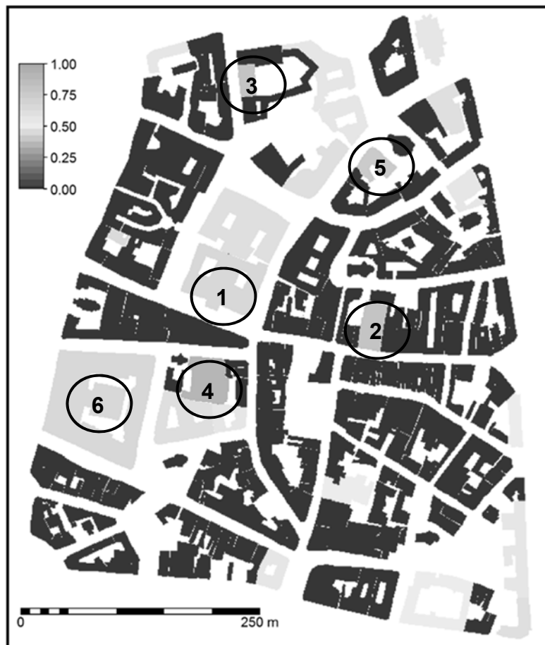
Fig. 3. Suitability map for Lipschani historical centre and the buildings selected for decision-making phase.

We analyzed all the buildings having damage codes greater than 0 (used for damaged buildings or under construction) and areas larger than 1,000 square meters. The next step was to weight the factors and the group of factors. The method selected was the ranking order, setting the factors and/or the group of factors by their importance.