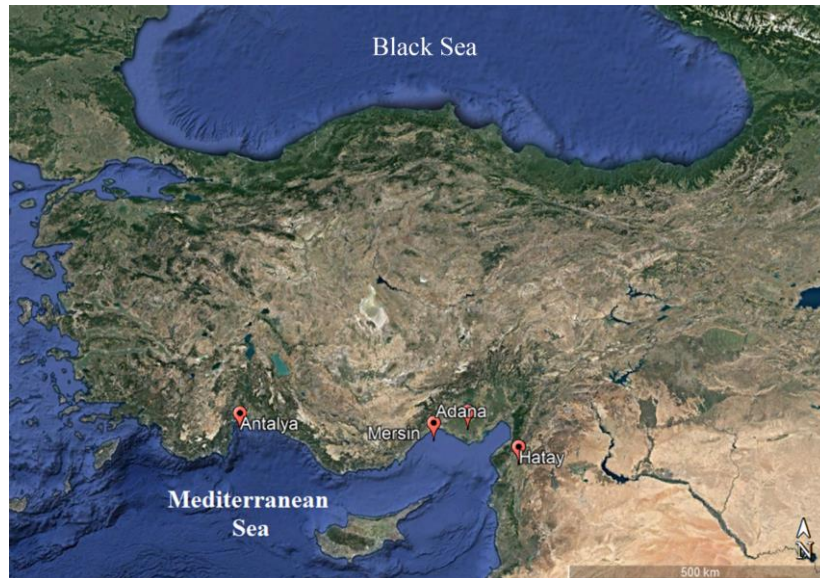
Fig. 1. Provinces (Antalya, Mersin, Adana, and Hatay) in the Mediterranean Sea coast of Turkey [10].

Nutrient pollution leads to depletion of oxygen, which allows the habitat to survive in the receiving water environment [9]. In this sense, the most crucial aim of the research is to determine and reveal the actual nutrient pollution by using statistical methods.